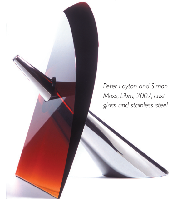
Peter Layton and Simon Moss, Libra, 2007, cast glass and stainless steel